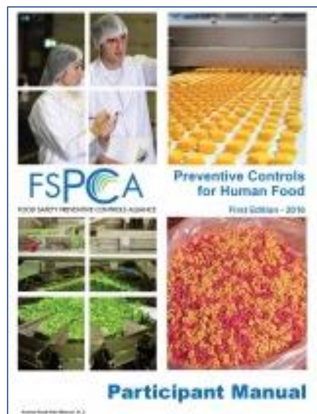
The FSPCA Preventive Controls for Human Food Participant Manual (2016 Edition)

It is strongly recommended that you use the Participant Manual while completing Part 1: Online. You can access a free .PDF version . Please be advised that the free .PDF version is 526 pages if you intend to print it yourself. You can order a hard copy for $30 from the FSPCA Bookstore .